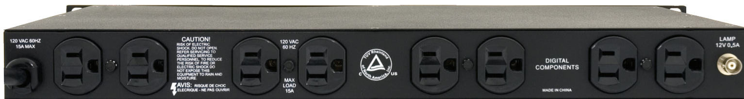
Rear panel identical on all models.

When voltage rises to extreme levels because of a lost neutral line or an accidental connection to 208 or 240 VAC, Furman's Extreme Voltage Shutdown kicks in, automatically powering down all equipment quickly and safely in order to prevent damage from occurring. An indicator LED will then illuminate, alerting you to the situation until the over voltage condition is corrected.