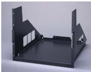
RK-C1900E ■ EIA Rack Mount Adapter